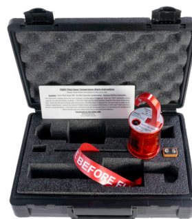
PN: PS-2 Kit